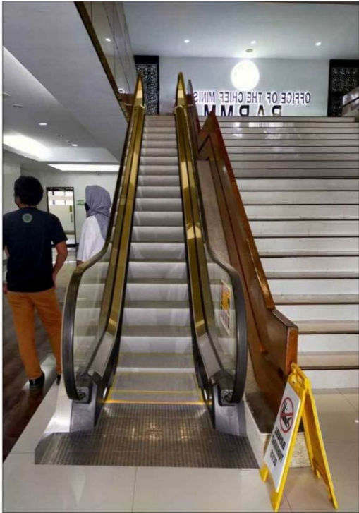
PERSPECTIVE LEFT SIDE VIEW