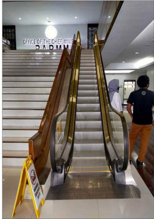
PERSPECTIVE LEFT RIGHT VIEW